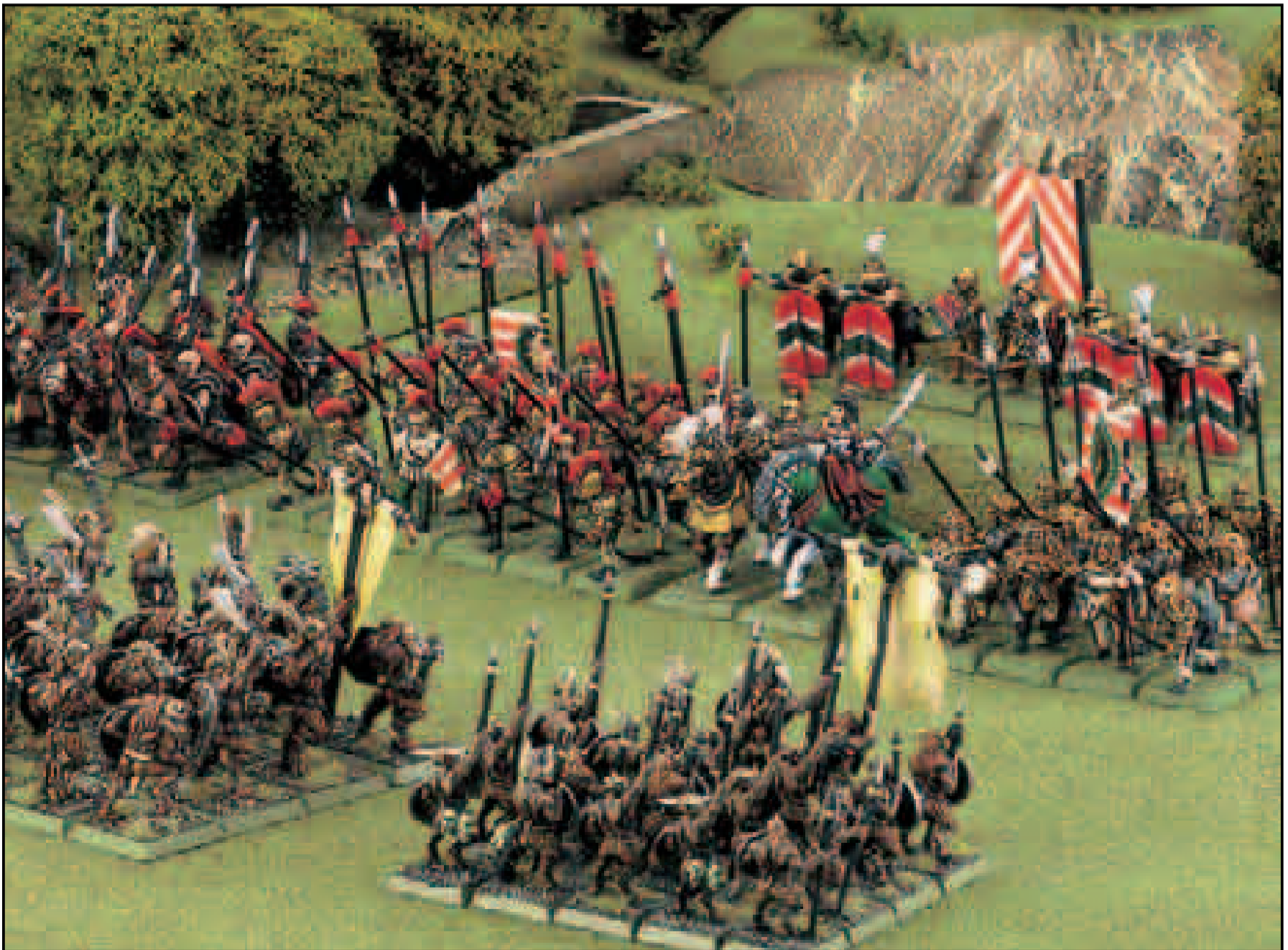
General Enzo's Dogs of War army prepares to fight off a ferocious Beastman warband.

Special Rules: Treat as a stone thrower from the rulebook (page 120) with the following changes. The Hot Pot has a maximum range of 36". Hits are resolved at S3, with no armour save allowed. The model under the hole of the template suffers a Strength 6 hit, with no Armour save allowed, which causes D3 wounds.